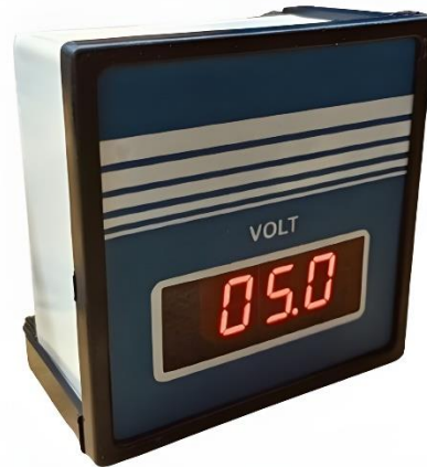
(Volt – 96x96mm)