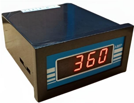
(Amp - 48x96mm)