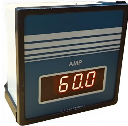
(Amp - 96x96mm)